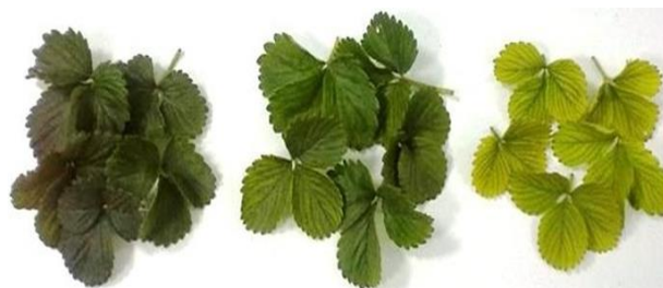
Fig. 1: Three strawberry plant samples with dark green leaves (left), light green leaves (medium) and yellowish leaves (right)

DG: Dark green plant area, LG: Light green plant area, Y: Yellow plant area