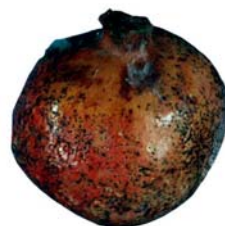
8 Weeks at 2.2°C and 3 Days at 20°C