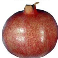
8 Weeks at 10°C and 3 Days at 20°C