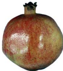
8 Weeks at 5°C and 3 Days at 20°C