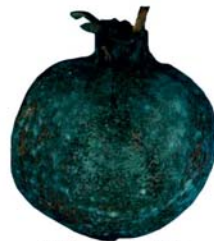
8 Weeks at -1°C and 3 Days at 20°C